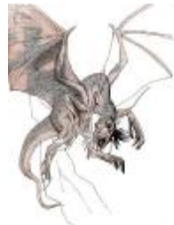
10 - CREATURE?