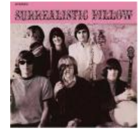
9 - 1967 ALBUM?