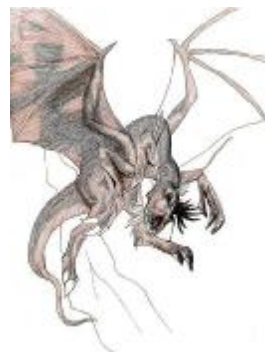
10 – CREATURE?