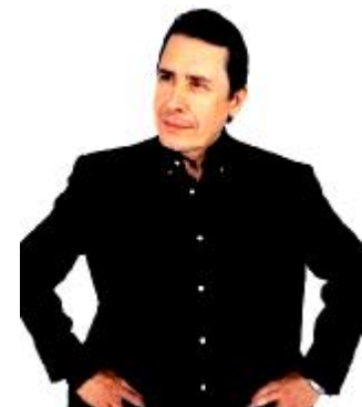
6 – MUSICIAN?