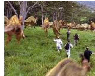
8 - 2001 FILM?