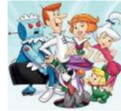
2 - TV PROG