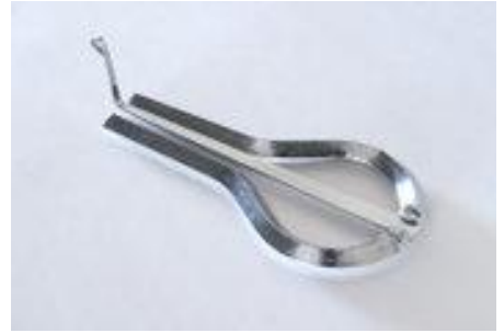
3 – INSTRUMENT?