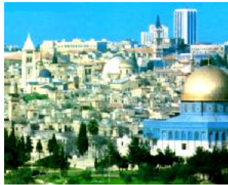
5 – CITY?