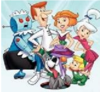
2 – TV PROG