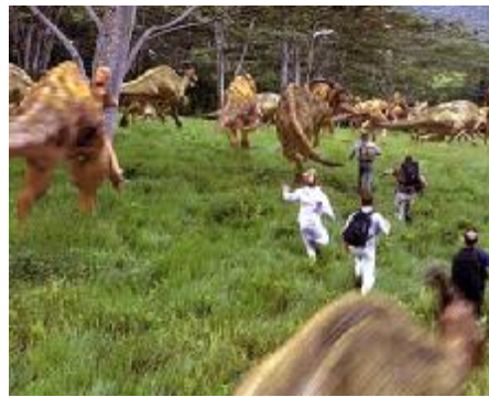
8 – 2001 FILM?