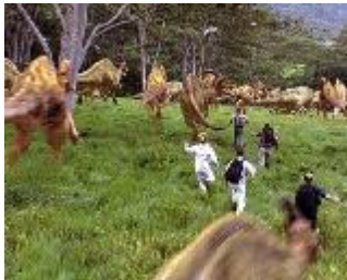
8 - 2001 FILM?