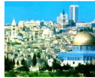
5 - CITY?