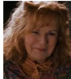
7 - ACTRESS