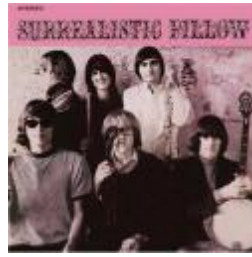
9 - 1967 ALBUM?