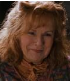
7 - ACTRESS