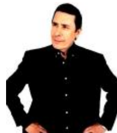
6 - MUSICIAN?