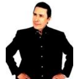
6 - MUSICIAN?