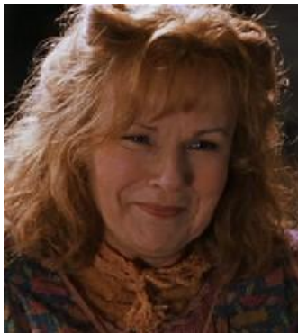
7 – ACTRESS