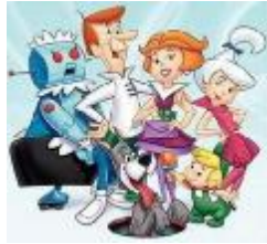
2 - TV PROG