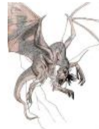
10 - CREATURE?