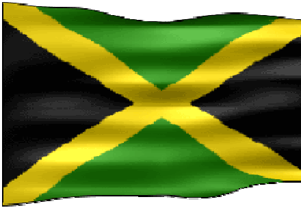
1 – COUNTRY?