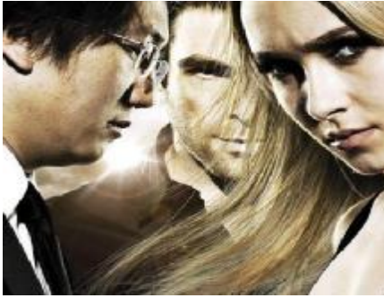
1 – TV?