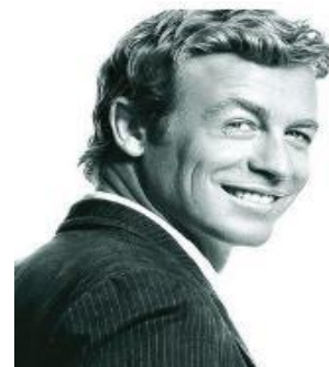
3 – TV?