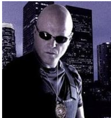
5 – TV?