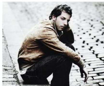
10 – WHO?