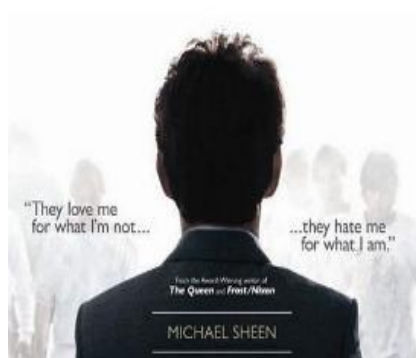
8 – FILM?