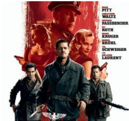
4 – FILM?