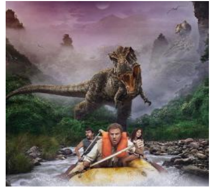
6 – FILM?