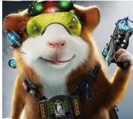
8 – FILM?