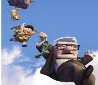
2 – FILM?