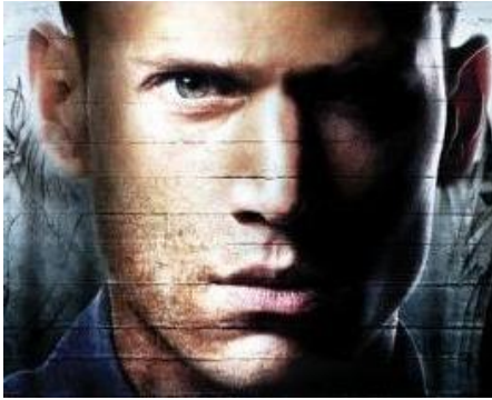
1 – TV?