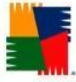
3 – SOFTWARE?