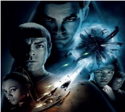
4 – FILM?